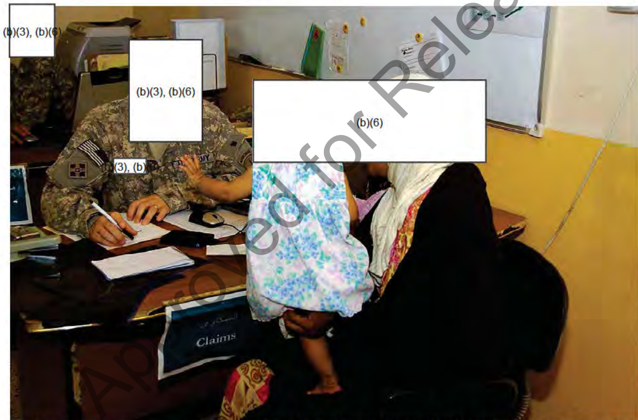
Photo 6: (b)(3), (b)(6) from the 432 nd CA Battalion (attached to 3/4 ID) process the claim of a resident whose home may have been damage at some point during the fighting with Coalition Forces. Inside the CMOC, the brigade established the Iraqi Assistance Center to compensation request.

The initial projects included clean-up projects related to keeping routes cleared for traffic and Coalition Forces. Then, the CMOC engaged with the local leaders and helped to establish the Neighborhood Advisor Council (NAC) and District Advisor Council (DAC) with AO Gold. Around June 2008, these groups held their first meeting in 14 months. 52