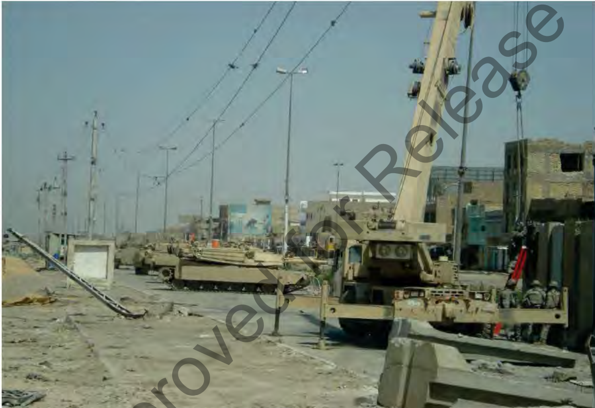
Photo 2: Members from the 821st Engineer Company (far right) and unknown infantrymen emplace barriers on AO Gold. In the foreground, three M1 Abrams tanks from 3/4 ID provide security for the barrier emplacement teams. Date - unknown

Within MND-B, the 35 th Engineer brigade 37 managed the 769 th Construction Effects Battalion and the 107 th Engineer Battalion. The 769 th oversaw the construction of vertical and horizontal projects throughout the MND-B area. The 107 th Engineer Battalion focused on clearing routes of roadside bombs. Various sapper companies from the battalion and organic route clearance units belonging to 3/4 ID became critical in ensuring freedom of movement along the construction site. The 821 st Engineer Company from the 769 th Battalion operated the cranes and armored forklifts along the wall construction site (Photo 2). Prior to receiving the task to construct this wall, the 821 st built walls along major roads and around JSSs and COPs. These were relatively quiet missions which involved little combat. These sappers would soon learn that building the wall in Sadr City would become a combat task.