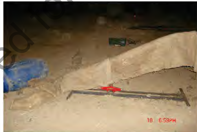
Photo 1: To conceal their rockets from UAV and AWTs, IDF teams concealed their rockets under tarps. Within short time, reconnaissance operators learned this technique. When the rocket team returned, MND-B successfully delivered fire to eliminate the team and rocket system. Date: Unknown

SMuD tactics involved detonating an IED in place without attempting to recover any portion of the device prior to destruction. Often this meant destroying the explosives via direct fire from a Stryker or M1 Abrams Tank. This process allowed teams to clear the route more quickly, thus giving more time for barrier emplacement operations.