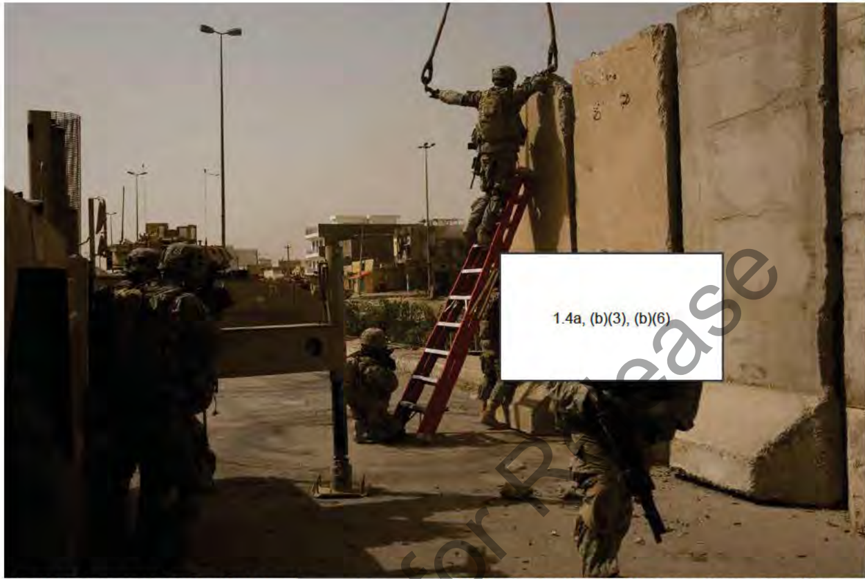
Photo 3: Even with protection from a [REDACTED] 1.4a M1 Abrams tanks, Air Weapons teams and other infantrymen, the four to six man construction team from B 1-68 AR came under daily enemy fire from buildings north of PL Gold. Date Unknown