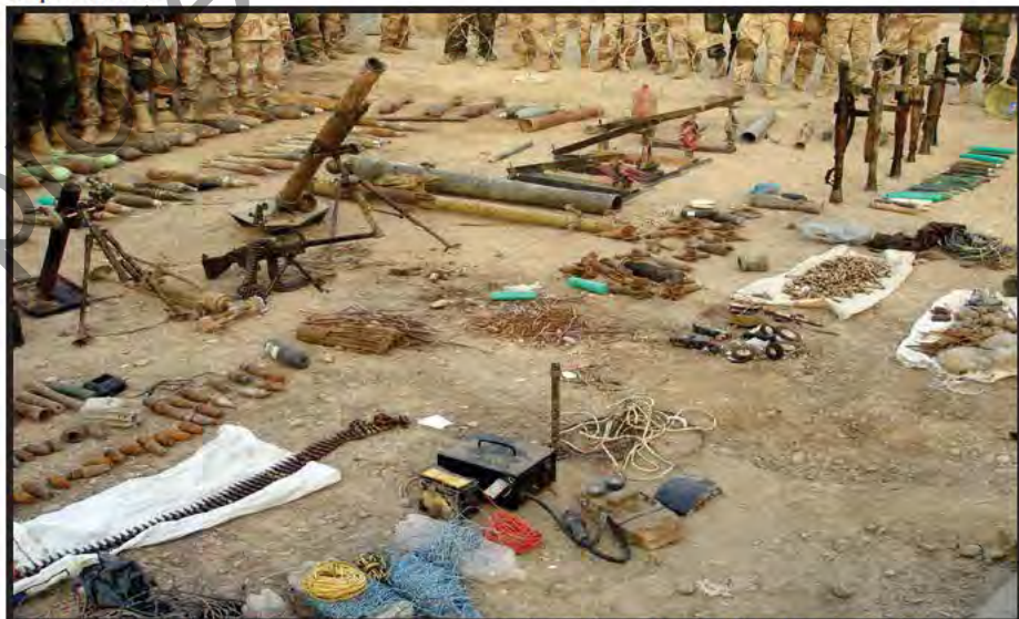
Photo #13: On May 21 st, Iraqi Army Soldiers from the 49 th Brigade seized this huge cache near the al-Sadr Hospital. The cache included mortars, EFPs, small arms rounds, RPG systems and a variety of other munitions. During clearing operations in Basra, the IA found huge caches of weapons and munitions, many of which appeared to have been recently supplied by Iran. In Sadr City, the results were very similar. By the end of June, the Iraqi Army found caches, including 175 IEDs, 76 EFPs, numerous RPGs, rifles, and over 320 mortar rounds. Date Unknown

None of the MITT teams could cite a specific decision or event which could be characterized as turning point for the 11 th IA Division during the March to April timeframe. However, the Iraqis gradually gained confidence as they continued to operate and have battlefield successes. Some of the factors specifically cited as improving the ISF confidence include improvements in the ISF leadership, CF firepower from armored systems and AWTs, and ISF successes on the checkpoints and within